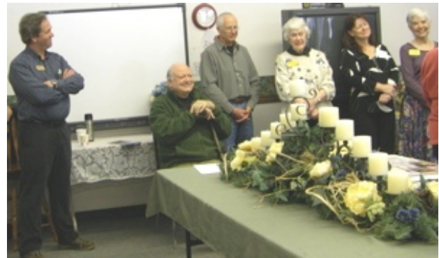
"Happy gardeners gathering"