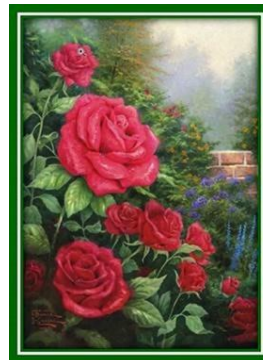
Painting by Thomas Kincaid