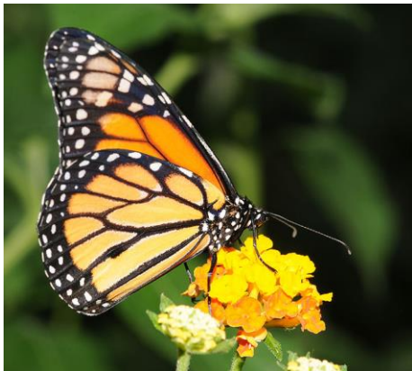
Monarch on lantana. All butterflies seem to love lantana. Thomas Bresson

The article isn't just about monarchs; it's about all the native insects in the US and how they are being impacted by humans. Interesting reading; hopefully more people will start planting host & food plants for the little critters that, as the article says, stitch together the web of life.