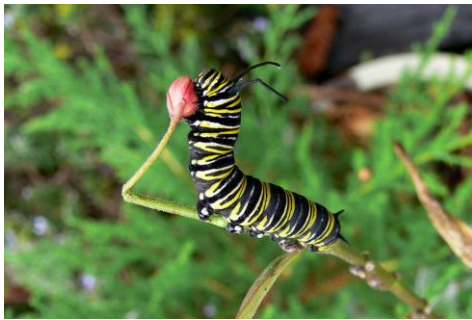
Monarch caterpillar on milkweed (asclepias incarnata)

http://www.nytimes.com/2013/11/24/sunday-review/the-year-the-monarch-didnt-appear.html?_r=0