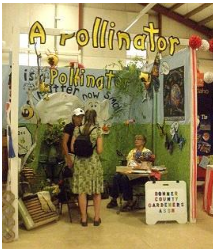
BCGA booth at the Bonner County fair