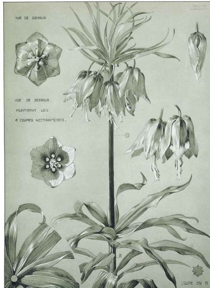
42 Crown imperial