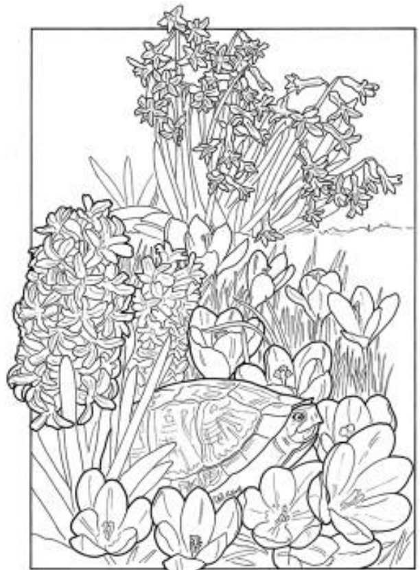
A Spring Garden Hyacinth ( Hymenocallis orientalis ), Dutch Crocus ( Crocus vernus ).

Set up is at 8am, for plant drop off. If someone has plants to donate but can't bring them, they can call Mikey Haven for pick-up at 610-4829.